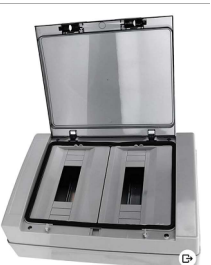
Outdoor Panel, 24 Lines, IP65